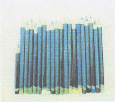
Selection of 19 Derwent Artists colour pencils $18 (3x blue, 5x red, 3 x brown, 4 x green & 1 each of purple/black/orange/white)

The pencils and books are nearly new and in very good condition. For more information please email Tina Grey tina06@xtra.co.nz Items are available to be picked up from Mona Vale on Wednesdays or can be posted for an additional $5.