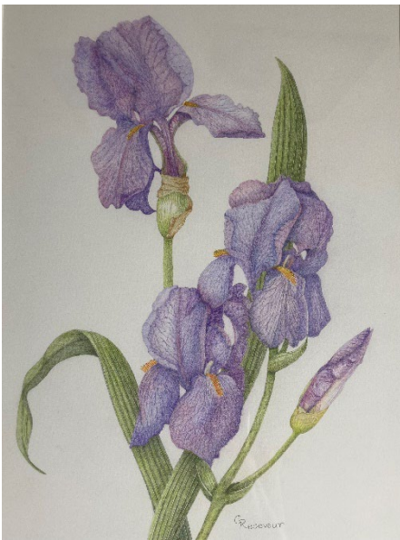
Gillian Receveur Blue Iris Colour Pencil 455x400mm Price: $850