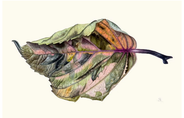
Birgit Rhode Hydrangea sp. Autumnal Leaf Watercolour 490x640mm Price: $1200