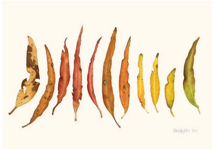
Claire Broughton Eleven Eucalyptus Leaves Watercolour 440x640mm Price: $1250