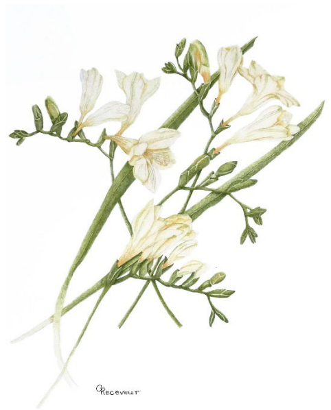
Gillian Receveur Freesias Colour Pencil 485x390mm Price: $650