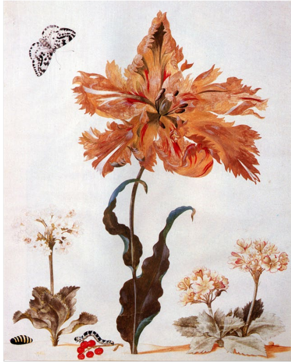
A Parrot Tulip and Red Currants, with a Magpie Moth, its Caterpillar and Pupa by Maria Sibylla Merian (1647-1717) Black chalk, bodycolour and watercolour