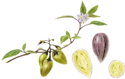
Lesley Alexander Pepino Incredible Ruby Watercolour 400x515mm Price: $750