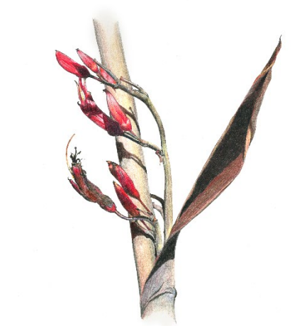
Vicki Jones Harakeke on Harakeke II Colour Pencil, Giclee Print 400x520mm Price: $700