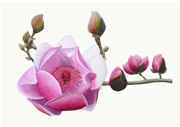
Birgit Rhode Magnolia in Flower Watercolour 440x540mm Price: $1100