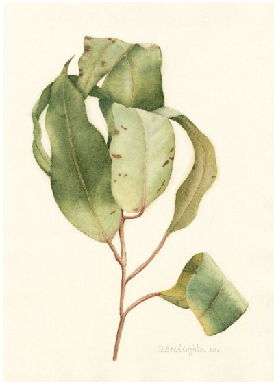
Claire Broughton Eucalyptus Cluster Watercolour 620x450mm Price: $1350