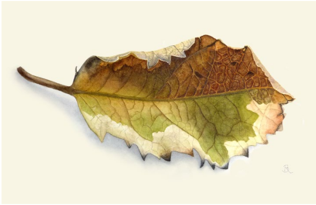
Birgit Rhode Kamahi Leaf II Watercolour 280x350mm Price: $750