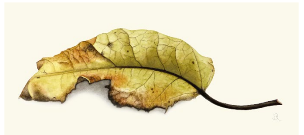
Birgit Rhode Kamahi Leaf I Watercolour 280x350mm Price: $750