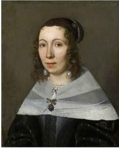
Maria Sibylla Merian

e-mail welcomeswallow.nz@gmail.com ; Tel: 07-858-3964; 378 Grey St Hamilton East