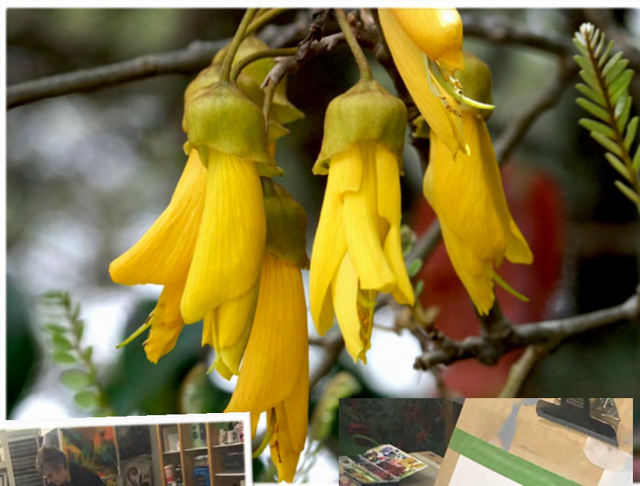
Kowhai - loco competition